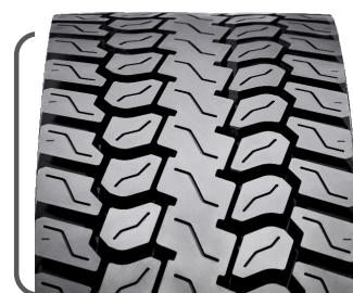
DV RT 5