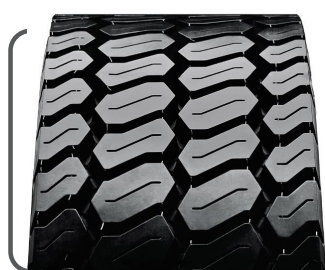
DV RT 2